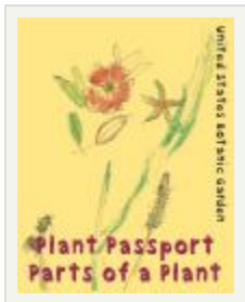
Parts of a Plant

Using this passport, students explore our Conservatory to find seven different plants and learn about plant parts and function. This resource is great for our younger visitors. Allow 30 to 45 minutes for this activity. Find the passports at the front information desk.